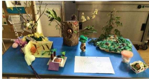
The Year 2 decorated egg entries