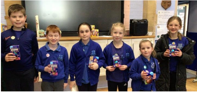
Egg rolling winners