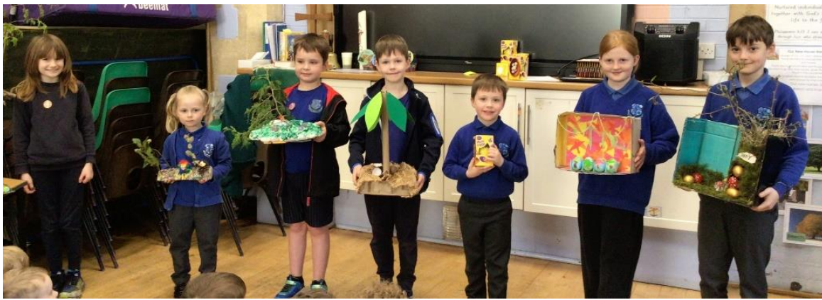
Our overall winners

It was such a challenge to judge the decorated egg competition this year. The entries were incredible!! All the staff had an anonymous vote and the results were so close! Well done everyone – they were all so unique and so beautifully presented! Please look at the photos on the website.