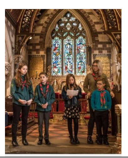
Nurtured individuals, learning together with God's love to live life to the full.