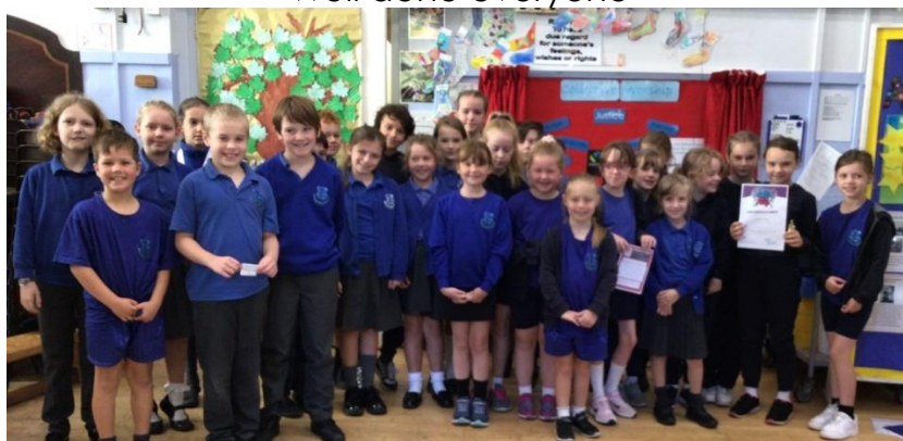
Class Estuary – made us very proud on their school trip!