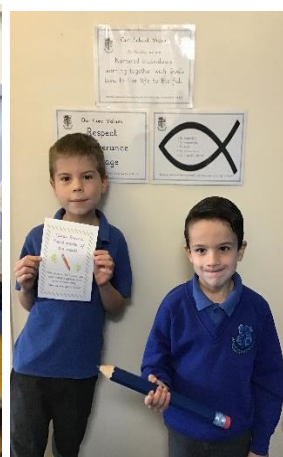
Well done everyone